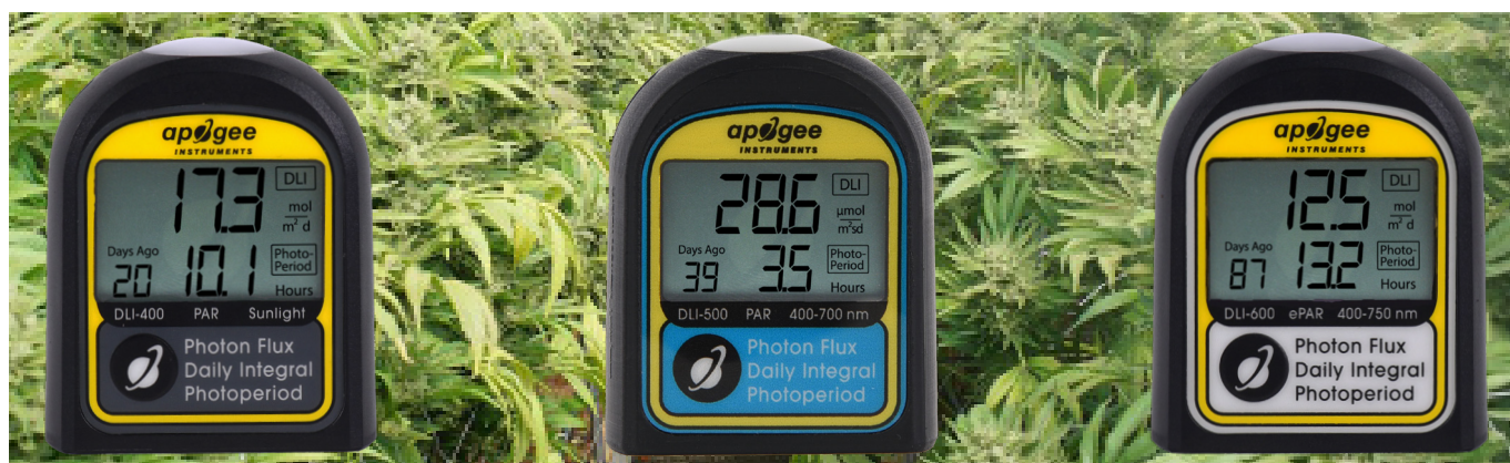
DLI-400: Sunlight Only PAR 400-700 nm

Apogee's new Daily Light Integral and Photoperiod meters are an elegant and accurate solution for measuring Daily Light Integral (DLI) and Photoperiod for up to 99 days.